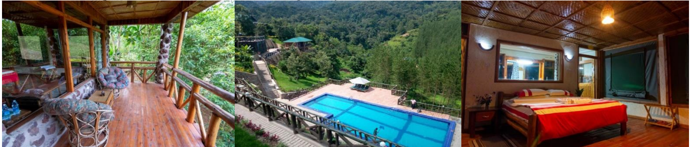
Rushaga Gorilla Camp

Return to the camp before sunset. Dinner and overnight stay.